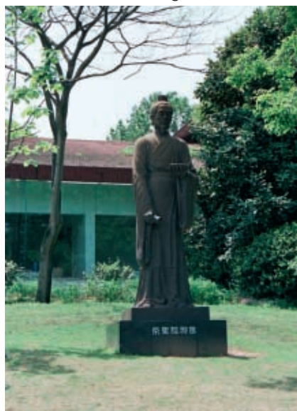
The statue of Lu Yu, the early tea scholar, at the tea museum near Hangzhou, China.

The next phase of work involved developing a standard for instant tea (ISO 6079) which is not only used for a more convenient way of preparing tea but is also a key ingredient in iced tea whether in the ready-to-drink form, which is increasingly becoming available, or in the dry mixes form which is available in countries where iced tea is very popular. The analytical methods to support this specification have also been developed and validated by international ring trials with laboratories representing producing and consuming countries.