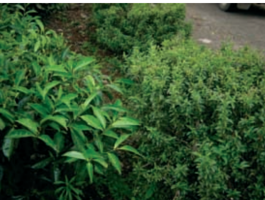
Above – Black tea (left) and green tea (right) bushes.

vide over 1000 billion cups of tea a year. Hot drinks represent about a third of all drinks consumed in the world and tea consumption is a quarter of all hot drinks. Over one and a half million tonnes of tea is consumed outside the producing countries and this valued at over USD16 billion in domestic consumption alone. Drinking tea is enjoyed in over 100 countries around the globe with different styles of infusion, by young and old alike, signifying the fundamental nature of tea's universal popularity. The billion dollar trade of tea between producing countries and consuming countries is therefore of major commercial importance and is also of key concern to many consumers. The degree of industrialization in producing countries, in the main, is much less than that in the majority of the consuming countries and tea is plays an import part in their economy. Consumption