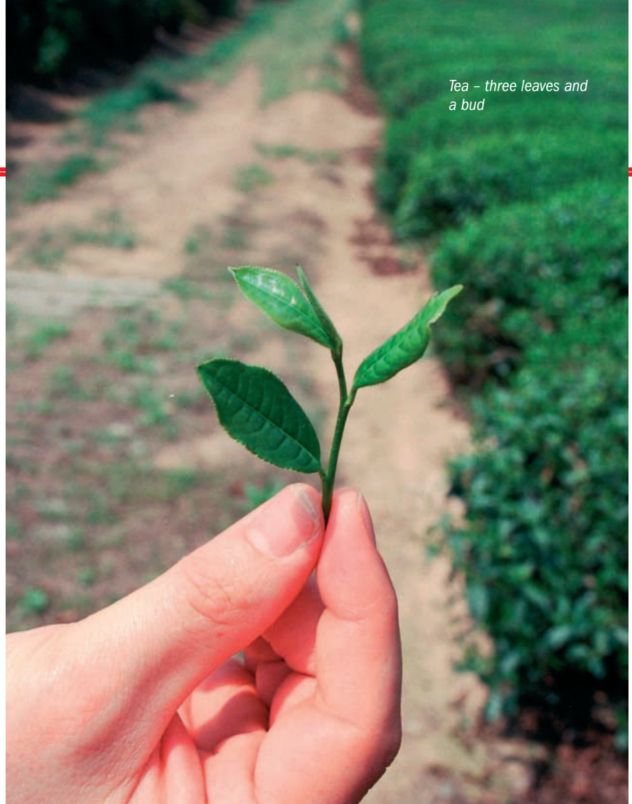
Tea - three leaves and a bud

The early plants, or more correctly trees, were found in south-west