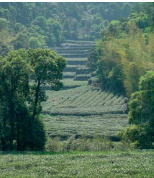
Below – Green tea growing near Hangzhou, China the area famous for the, 'Longjing' (Dragon Well) tea.