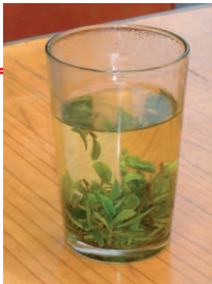
The famous Longjing (Dragon Well) green tea.

The working group including participants in the UK, Germany, China and initially Malawi who looked at a number of different methods of analysis to form the basis for measuring total polyphenols (flavonoids) in tea before basing its work on the method of Singleton & Rossi's 1965 paper in the American Journal of Enology and Viticulture . The challenges were