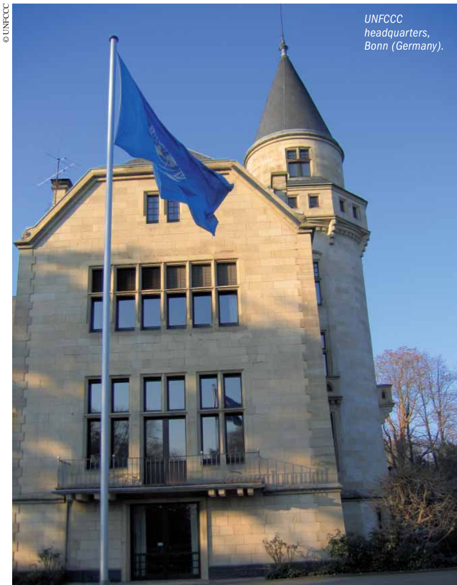
UNFCCC headquarters, Bonn (Germany).

Richard Kinley: The carbon market provides opportunities for cost-effective means to reduce emissions. Like standards in any other market these ISO standards will provide frameworks for assessing and verifying greenhouse gases at different levels. Applied broadly they