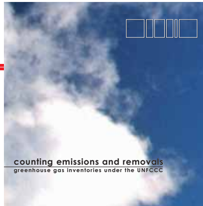
Counting emissions and removals – Greenhouse gas inventories under the UNFCCC.

The global accreditation operation is one of the core elements of the CDM. It involves international assessment teams and an accreditation panel that makes recommendations on accreditation to the CDM Executive Board. The panel, which provides technical support to the CDM accreditation system, includes very experienced experts from national and international accred-