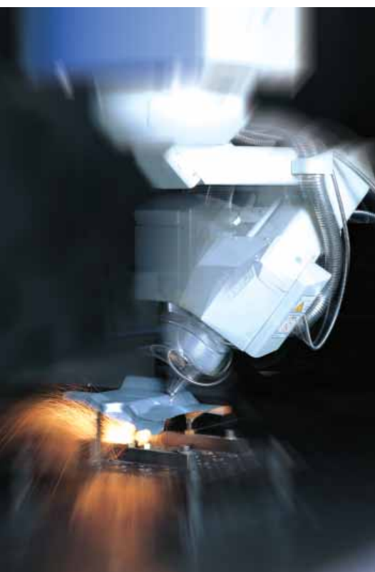
Laser processing machines.

safety through risk assessment based on ISO/IEC Guide 51, Safety aspects – Guidelines for their inclusion in standards , ISO 14121, Safety of machinery – Principles of risk assessment , and ISO 12100, Safety of machinery – Basic concepts, general principles for design . As the top-ranking standard within safety standards in the home appliances field, we have put in place the fail-safe design standard, that reestablishes any malfunction to bring it in line with the standard's safety criteria. This standard seeks to ensure development of reasonably safe, free-from-hazard products that may cause injury or damage to users.