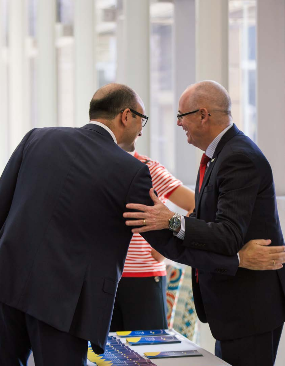
Cover image : Members discussing together at ISO Week 2019 (Cape Town, South Africa)