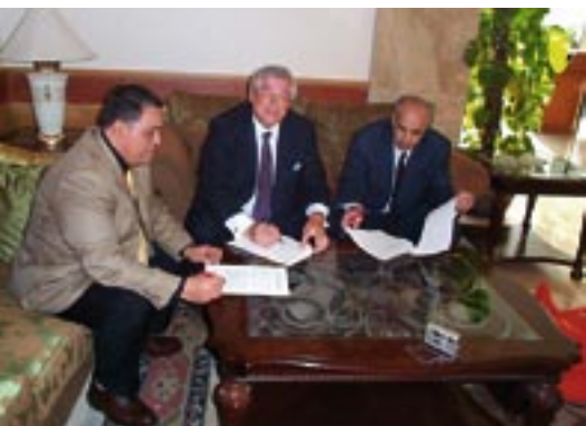
A cooperation agreement was signed between the Egyptian Organization for Standardization and the Arab Academy.

In response to the global concern for the environment, PQI established an environmental management systems (EMS) programme whereby students can learn about the purpose, benefits and operational mechanisms of an EMS and the ISO 14000 family of standards on environmental management, as well as understand the role of auditors. Through an advanced and practical implementation of the ISO 14000 systems programme, the institute enhances awareness of environmental issues in the African continent.