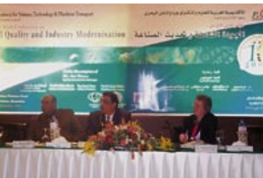
The first Arab Conference on Total Quality and Industry Modernization in March 2003.

The PQI team is proud to be the first in the Arab world to introduce Lead Auditor courses, as an innovative solution to the requirements of the Arab community. The Chartered Quality Institute (CQI) registered courses offer students an understanding of business systems management. This will allow them to specify, define and improve the performance of business processes and identify a range of potential root causes.