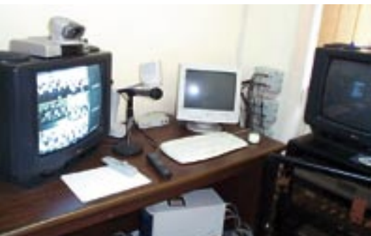
The Academy's video conference equipment.